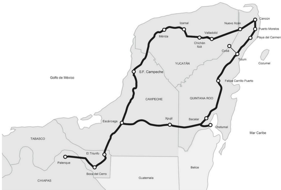
Figure 1. Maya Train Route

to the “clash of two logics, one Maya and one Western”; the conflict arising from this clash results in the dispossession ( despojo ) of Maya peoples from their ancestral territories when they come face-to-face even with projects that are sometimes labeled as sustainable or promoted under the banner of human rights.