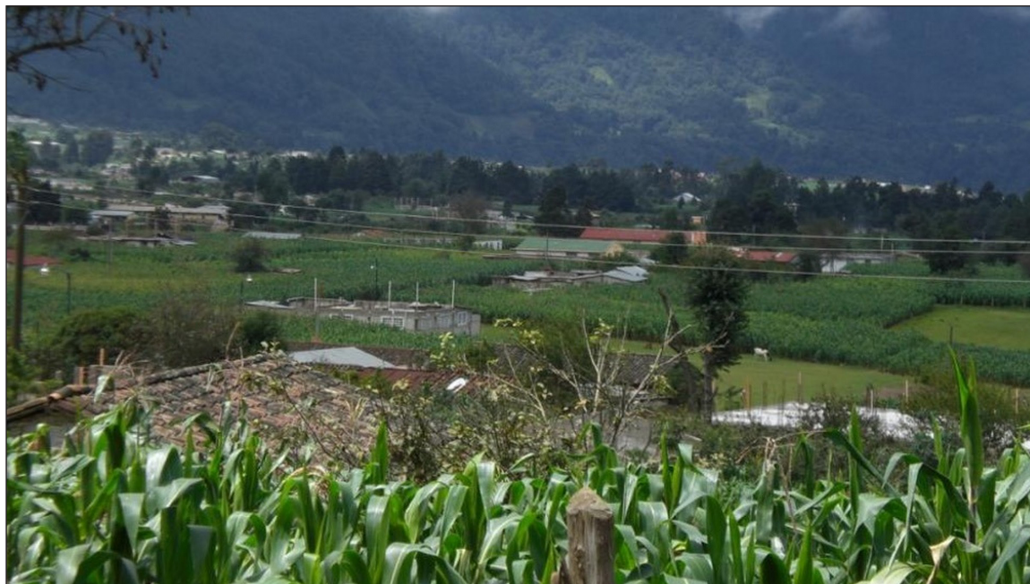
Figure 3. Landscape of Aldea Pachaj, Guatemala, where the reforestation project, Chico Mendes, is located.