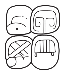
Figure 2 . Late 9<sup>th</sup> century bilingual spelling of Ihk' At / Wo('). Monjas Lintel 4 (underside): A4, Chichen Itza. Redrawn by Harri Kettunen after a drawing by Ian Graham.

This might help to explain the otherwise unique wo-hi spelling on a Late Classic codex-style vase (Figure 3:M4), first noted by Simon Martin (1997:854; 2017). Although this might seem to provide some evidence for a Yukatekan affiliation, other spellings on the same vase—such as [ K'AN ] JAL-bu (at B1, I4b, and L1b), UUN-wa (at G2b), and ka-se-wa (at