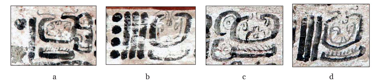
Figure 4. Variant spellings of the month Zec in the Dresden Codex: (a) 7-se-ka-wa, Dresden 62; (b) 19-se-ka, Dresden 46; (c) CHUM-se-ka, Dresden 50; (d) 15-se-ka, Dresden 50.