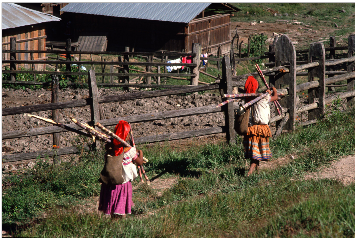
Figure 3. Traditional Tojol-ab'al women carrying wood and cane.