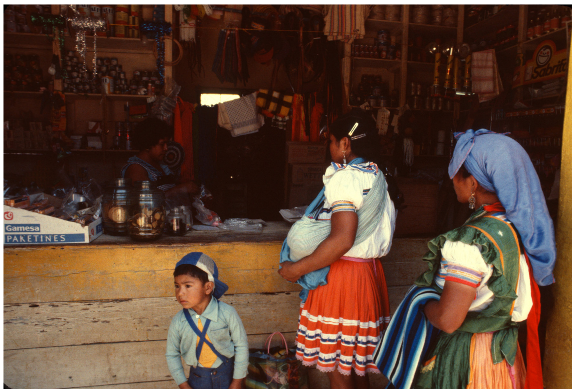
Figure 4. Women making purchases at a traditional Tojol-ab'al community store.