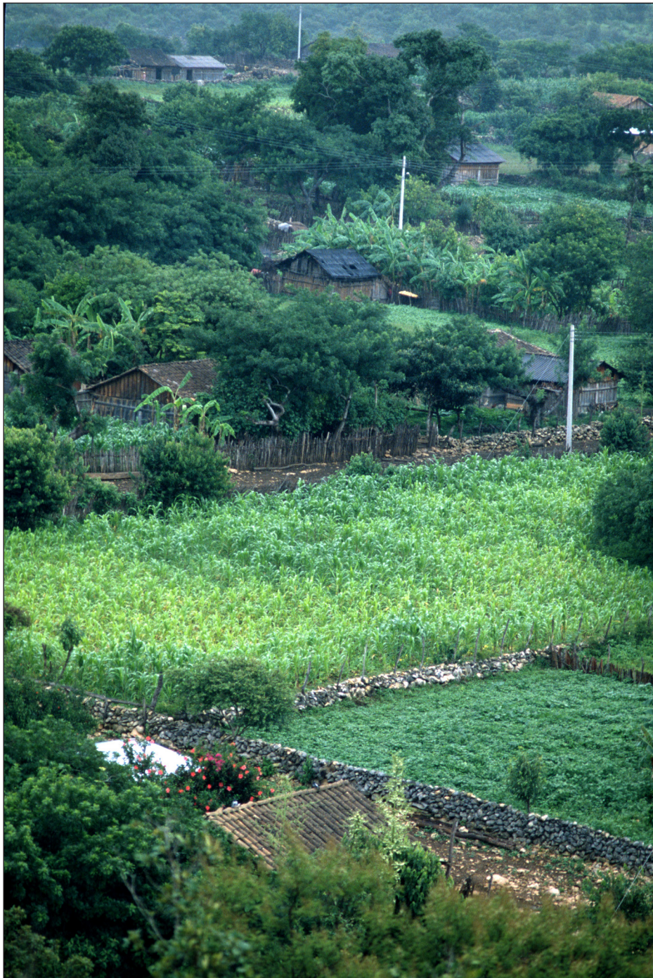
Figure 2. Traditional Tojol-ab'al community showing houses and cornfields