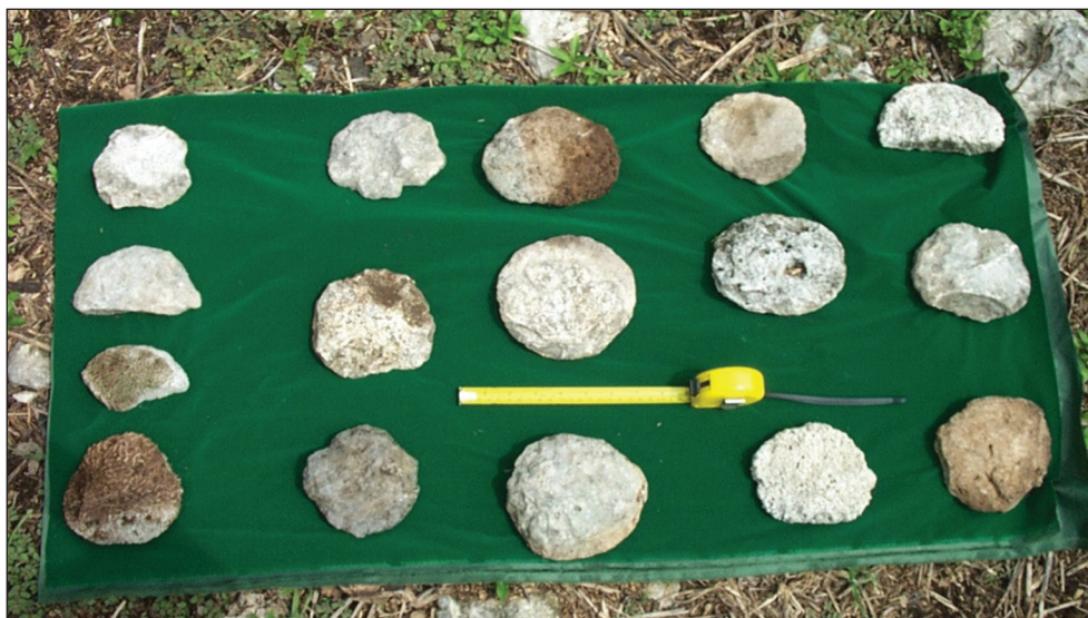
Figure 2. Archaeological Stone disks found in Buena Vista, Cozumel 4

At Chan Chen, excavations in two structures from Group F revealed a good number of stone disks (Sidrys 1983:92-106). The first is Structure F-4, a 1 m-tall, 7 x 10 m rectangular platform located in the center of Group F. Excavations in Structure F-4 uncovered 33 limestone disks at 25-45 cm below surface, above a sealed thick plaza floor associated with Early Classic and Late Preclassic material. Interestingly, several Late Postclassic censer sherds of a possible representation of the