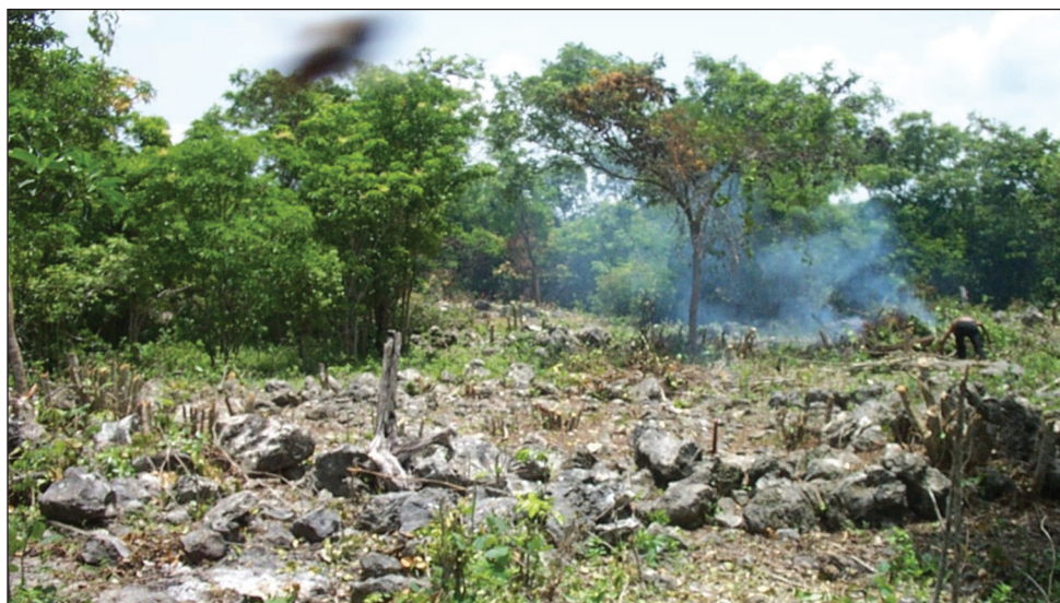
Figure 3. Prehispanic circular apiary found in Buena Vista, Cozumel (photo by the author).

Bee God Ah Mucencab (a.k.a. the diving god) were found on the surface directly above these stone disks (Sidrys 1983:250). A second deposit of two stone disks in association with more Ah Mucencab censer sherds was found in a small Late Postclassic shrine located in the northwest section of Group F. This shrine was a 1.5 x 1.2 m rectangular structure formed by 28-cm tall limestone blocks. In addition to the stone-disks, a cache consisting of a large tulip shell ( Fasciolaria tulipa ) and a barrel-shaped jade bead (2.2 cm in length, 1.4 cm in diameter) was found in this shrine, next to both its interior southern wall and a barrel-shaped stone (31 cm in height, 18-21 cm in diameter).