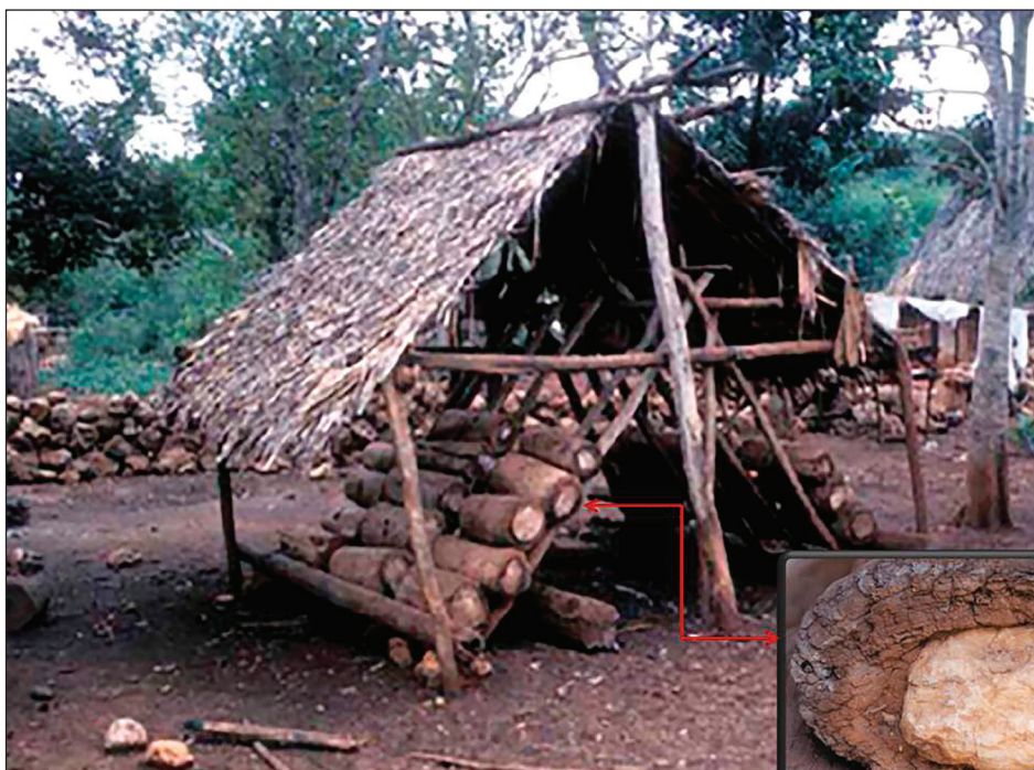
Figure 1. Contemporary Yucatec Apiary of stingless Melipona bee, showing the use of stone disks plugging tree log hives.